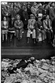
Henri Cartier-Bresson: Coronation of King George VI, London, Great Britain , 12 May 1937, © 2024 Fondation Henri Cartier-Bresson / Magnum Photos