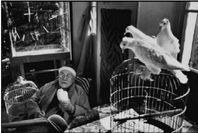
Henri Cartier-Bresson: Henri Matisse at Home, Vence, France, 1944