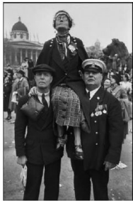
Henri Cartier-Bresson: Coronation of King George VI, London, Great Britain , 12 May 1937, © 2024 Fondation Henri Cartier-Bresson / Magnum Photos