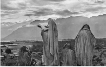
Henri Cartier-Bresson: Srinagar, Cachemire, India, 1948 , © 2024 Fondation Henri Cartier-Bresson / Magnum Photos