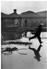
Henri Cartier-Bresson: Behind the Gare Saint-Lazare , 1932, © 2024 Fondation Henri Cartier-Bresson / Magnum Photos